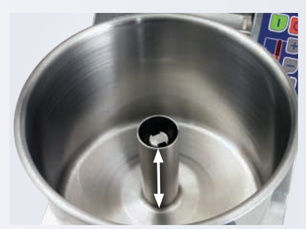
Bowl with high chimney