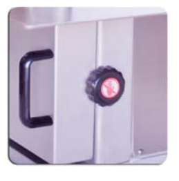
Door Safety Switch