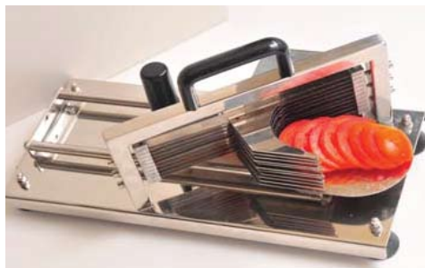
Fig.2 (view from rear)