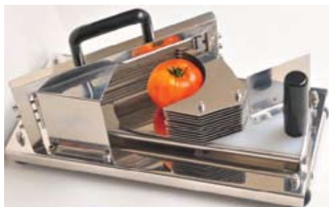
Fig.1 (view from front)

The Grange Tomato Slicer is compact, sturdy and easy to use. It can cleanly cut mounds of uniformly sliced tomatoes and features a unique new design for fast, trouble-free operation and easy clean up.