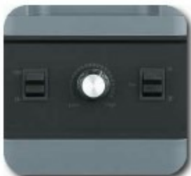
2 Speed toggle with pulse

Independently risk assessed to ensure compliance with Australian Standards