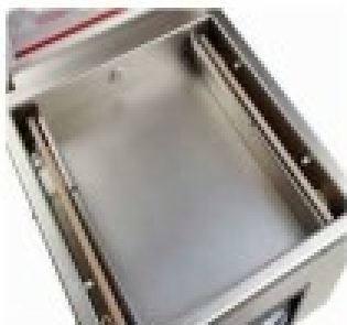
Double Seal Bar

Independently risk assessed to ensure compliance with Australian Standards