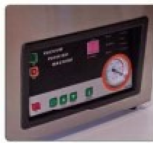
Simple control panel