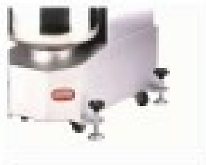
Wheels & Castors