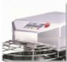
10 Speed settings

Independently risk assessed to ensure compliance with Australian Standards