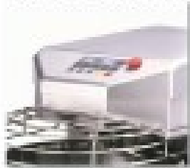
10 Speed settings

Independently risk assessed to ensure compliance with Australian Standards