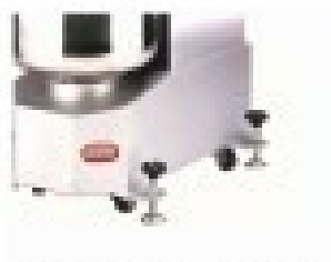
Wheels & Castors