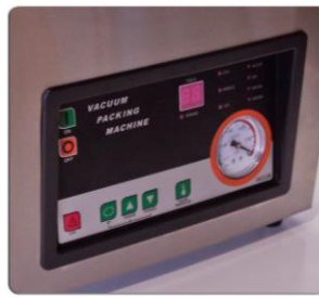
Simple control panel