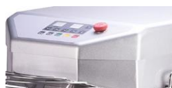
10 speed settings

Independently risk assessed to ensure compliance with Australian Standards