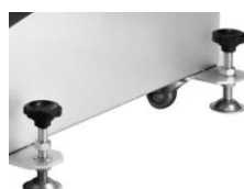
Wheels & castors