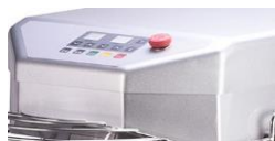
10 speed settings

Independently risk assessed to ensure compliance with Australian Standards