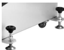
Wheels & castors