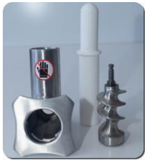
Stainless steel Worm, barrel etc

Independently risk assessed to ensure compliance with Australian Standards