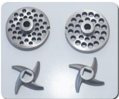
6mm & 8mm Plates included