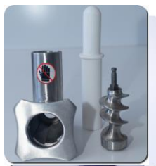
Stainless steel Worm, barrel etc

Independently risk assessed to ensure compliance with Australian Standards